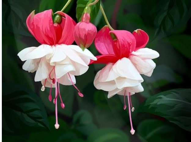
12 - Molly Siebert